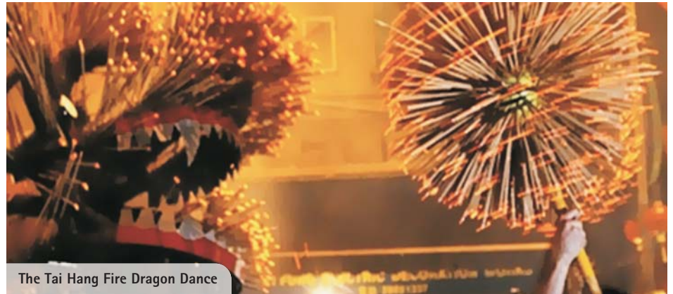
The Tai Hang Fire Dragon Dance

A soothsayer decreed the only way to stop the chaos was to stage a fire dance for three days and nights during the upcoming Mid-Autumn Festival. The villagers made a huge dragon of straw and covered it with incense sticks, which they then lit. Accompanied by