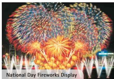
National Day Fireworks Display