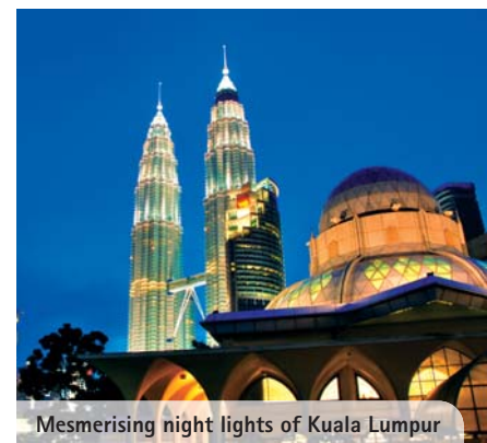
Mesmerising night lights of Kuala Lumpur

A meal at Shin Kee is simple - you walk in, place your order at the counter, decide if you want the noodles to be cooked in soup or dry, and choose your preferred beef cuts. Finally state whether you want to have a regular portion (RM6.00 or USD$2) or with EXTRAS at RM8.00 or US$2.50 per bowl.