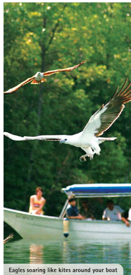
Eagles soaring like kites around your boat

As more and more brown-feathered raptors appear, get ready your cameras to capture one of them diving magnificently like a World War II bomber and snatching a morsel of food from the water surface with its talons.