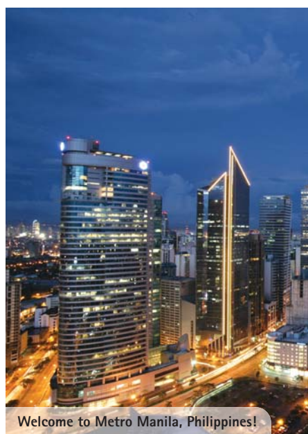
Welcome to Metro Manila, Philippines!

This is an entrepreneurship and business event dedicated to Overseas Filipino Workers looking to invest and start a business in the Philippines. A congress will be held during the exhibition at same venue in the Megatrade Hall, Philippines.