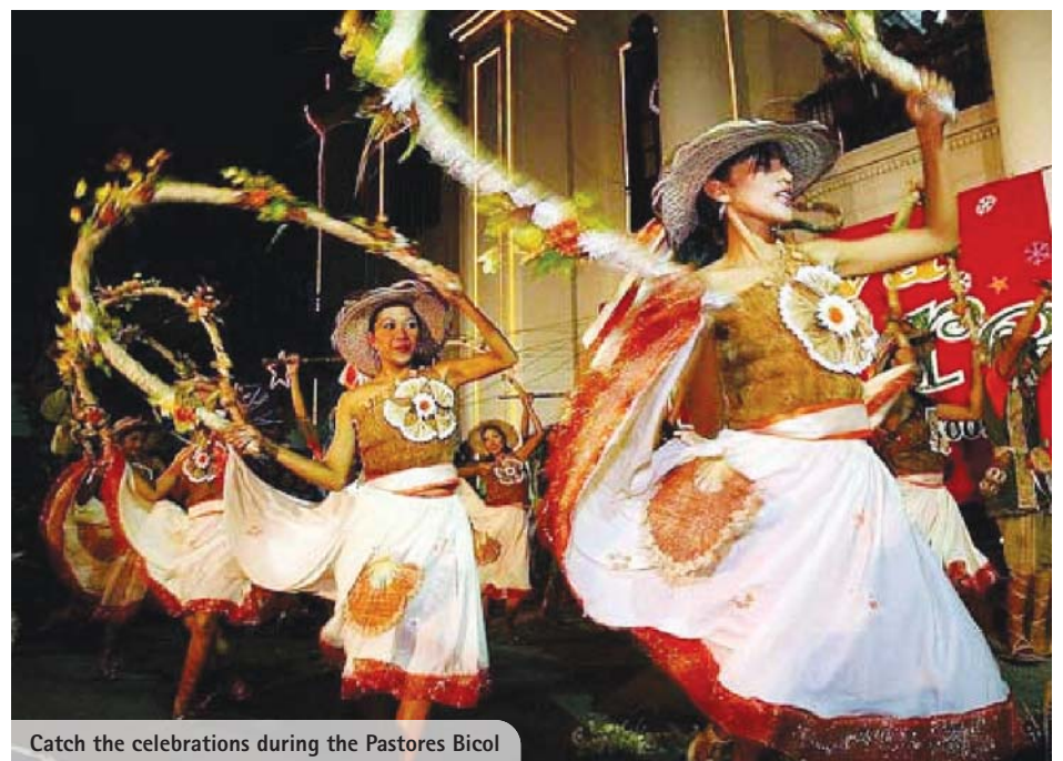
Catch the celebrations during the Pastores Bicol