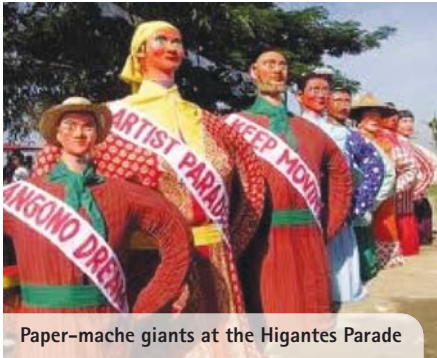
Paper-mache giants at the Higantes Parade