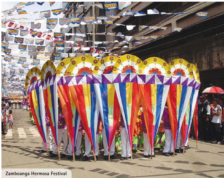
Zamboanga Hermosa Festival

Hidden Valley is situated between two mystical mountains - Mt Makiling and Mt Banahaw. The landscape encompasses a 110 acres wide