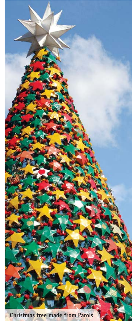
Christmas tree made from Parols

In Camarines Sur, these "dancing girls of Christmas", dressed in colourful festive costumes, appear on Christmas Day up to the Epiphany - 13 days of house to house singing and dancing - commemorating the shepherds proclaiming glad tidings. This is the follow up to Kagharong, the re-enactment of Saint Joseph and the Virgin Mary's plight as they looked for a place to stay in Bethlehem on Christmas Eve.