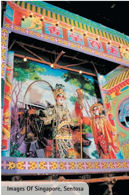
Images Of Singapore, Sentosa