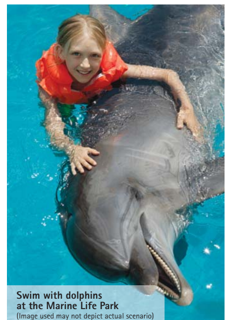
Swim with dolphins at the Marine Life Park (Image used may not depict actual scenario)