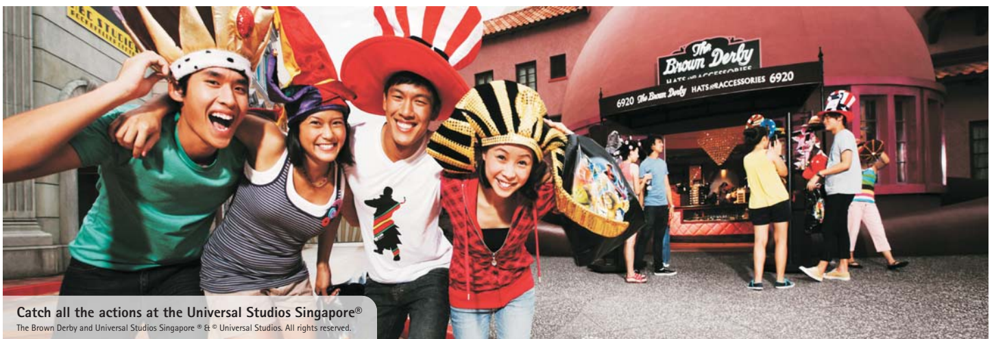
Catch all the actions at the Universal Studios Singapore® The Brown Derby and Universal Studios Singapore® & © Universal Studios. All rights reserved.

For more information and bookings, please email: resvn@toueast.net