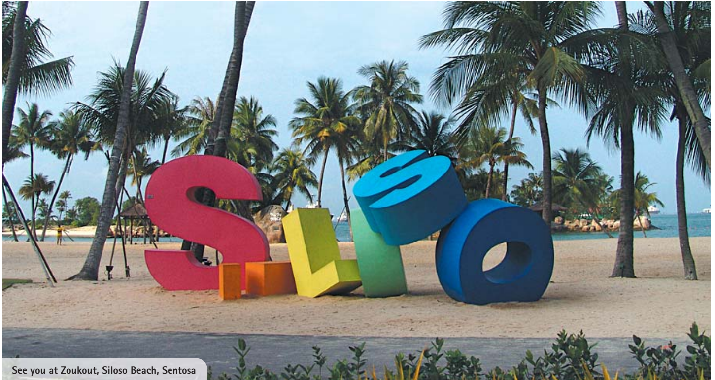
See you at Zoukout, Siloso Beach, Sentosa