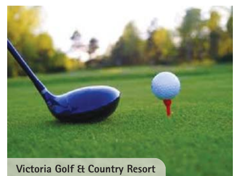
Victoria Golf & Country Resort

Shortly before the summit, where the steps become an almost vertical stairway, during the height of the season, pilgrims may have to wait in line for as long as half an hour before proceeding to the small platform on top. After completing their worship, pilgrims ring a bell, once for every visit. It is not unusual to hear the bell rung a dozen times or more by devout pilgrims who have made repeated voyages to the holy site.